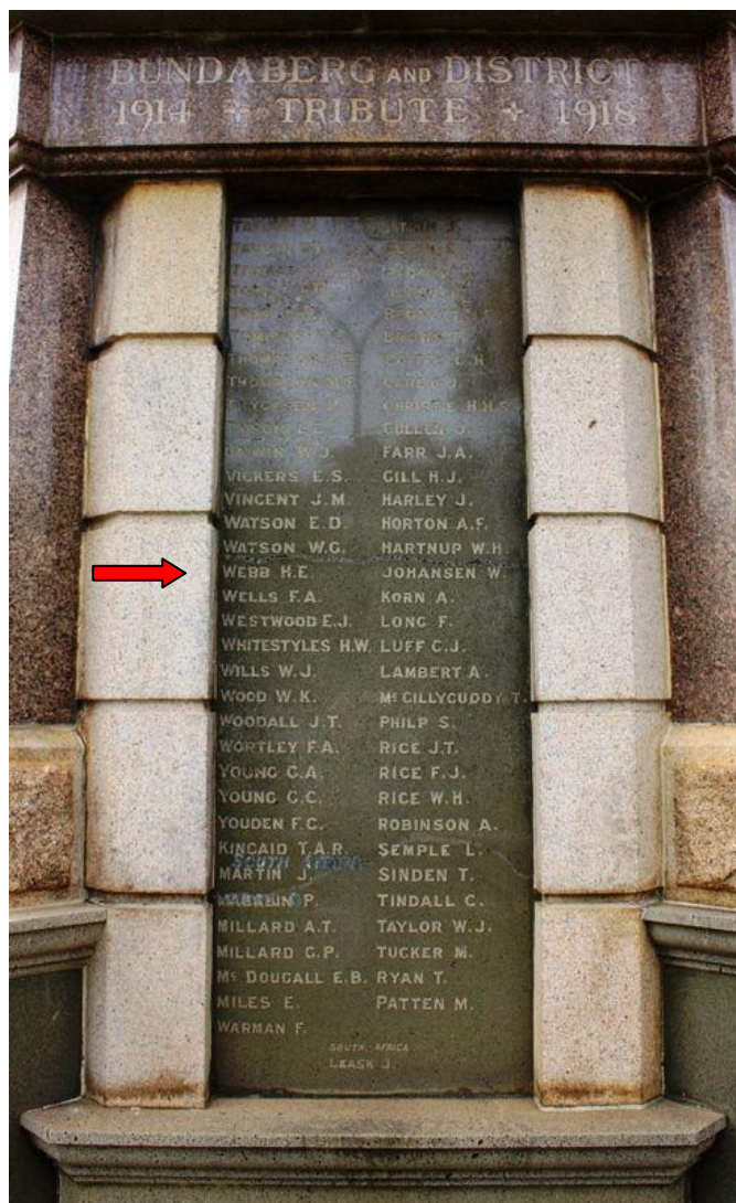
Bundaberg War Memorial